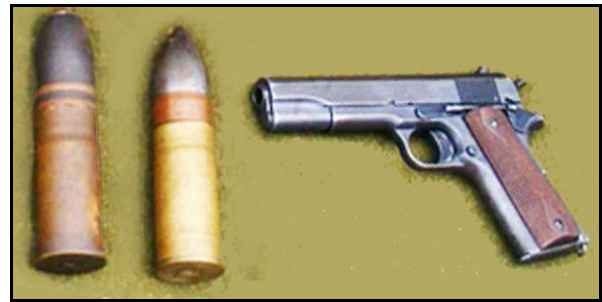
Figure 2 - Relative size of 37mm ammunition