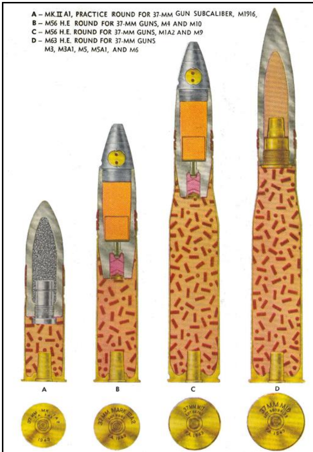
Figure 1 - Various US 37mm munitions