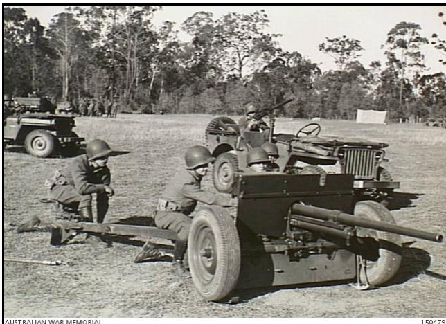
Figure 5 - US troops with 37mm antitank gun - Townsville, 1942 (AWM ID 150479)