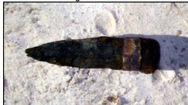
Figure 4 - 37MM HEBD artillery projectile - found on the Sunshine Coast, QLD