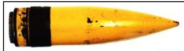
Figure 3 - 37MM HEBD artillery projectile - in good condition