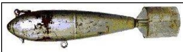
Figure 3 - Recovered UK/Commonwealth Practice Bomb