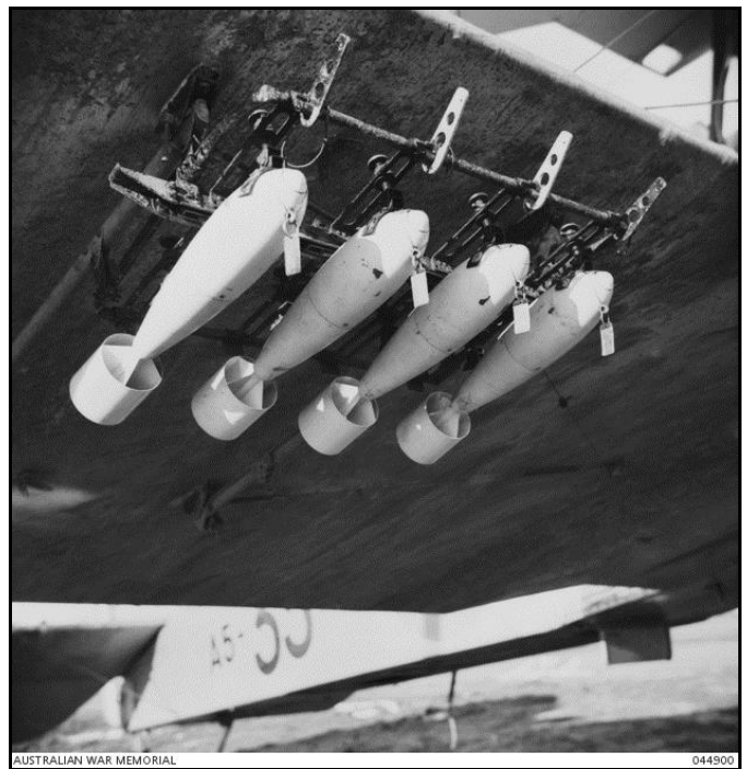
Figure 2 - 8 1/2 pound practice bombs fitted to a Hawker Demon aircraft RAAF Richmond, New South Wales, in 1939 (AWM ID number 044900)