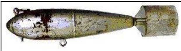
Figure 3 - Recovered UK/Commonwealth Practice Bomb