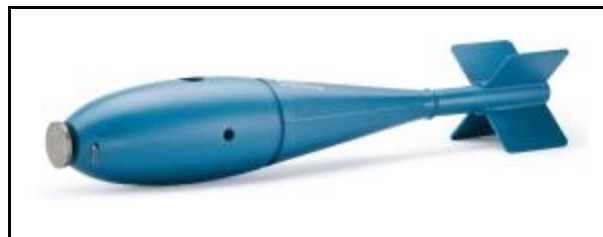
Figure 5 - Modern 25lb Practice Bomb (included for comparison purposes only)