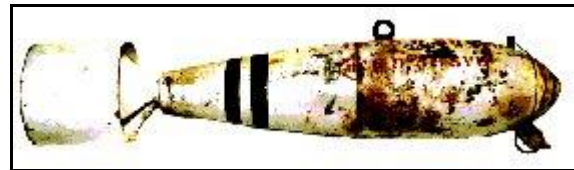
Figure 4 - Recovered UK/Commonwealth Practice Bomb