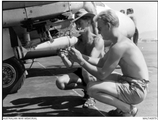
Figure 2 - RAAF armourers load a 25lb practice bomb onto an Australian Vampire aircraft 1954 (AWM ID number MALTA0979)